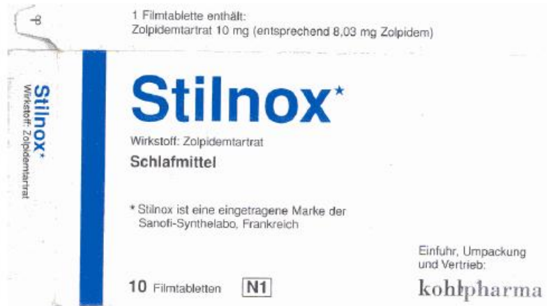
Figure 1: Figure of the imported drug package of Stilnox produced by Sanofi-Synthelabo and marketed by kohlpharma .