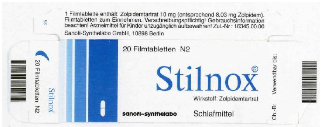
Figure 2: Figure of the original drug package of Stilnox produced by Sanofi-Synthelabo .