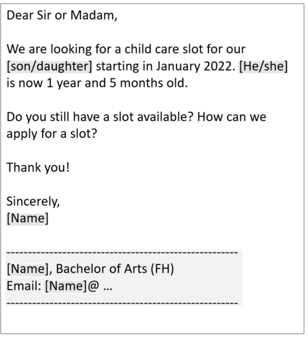
Figure 1: Email Template with Randomized Information Highlighted

Notes: Figure shows the email sent from fictitious parents to child care centers, translated from the original German version. Text marked in grey is randomized and differs by version of the email. We randomized the gender of the child (2 variations), the name of the parent (16), and whether or not we include an email signature (2). The signature indicates that the parent holds a bachelor's degree from a University of Applied Sciences, which is the most common university degree in Germany. We sent a total of 64 \ (2 \times 16 \times 2) different versions of the email to child care centers.