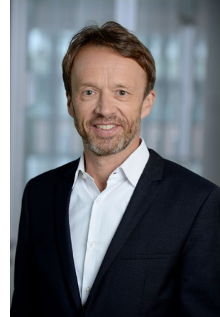
Dean of the Graduate School